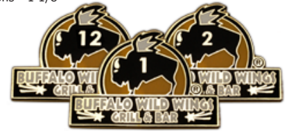
Die created for each year.