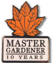
Identify your Organization