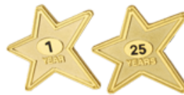
Year Pins - Star - 1 1/8"